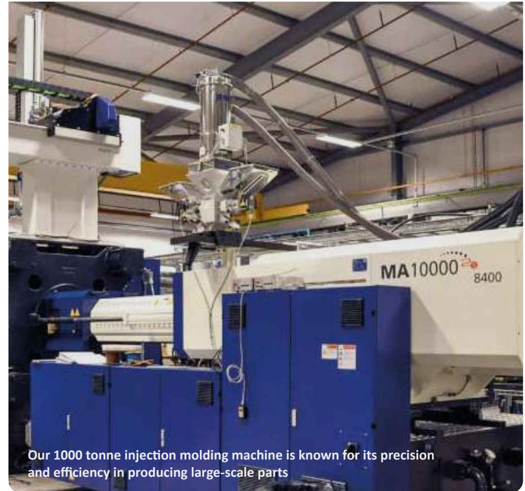
Our 1000 tonne injection molding machine is known for its precision and efficiency in producing large-scale parts