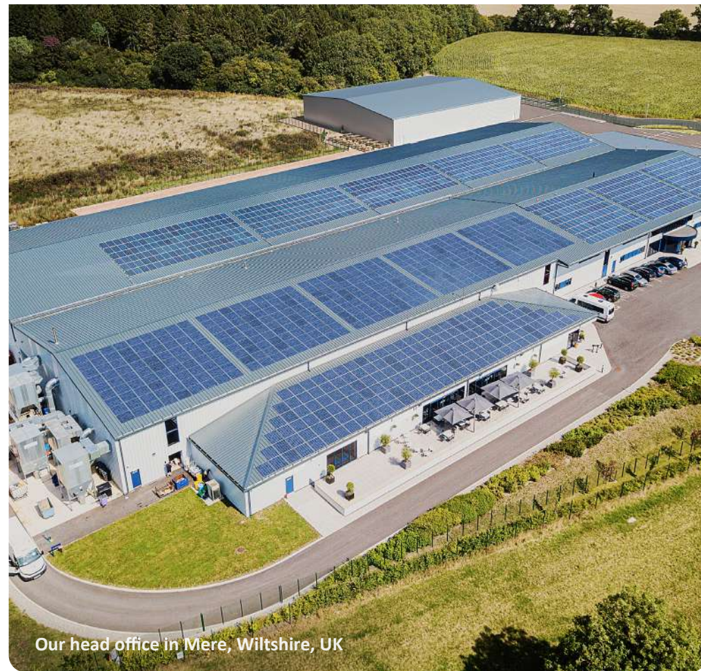
Our head office in Mere, Wiltshire, UK