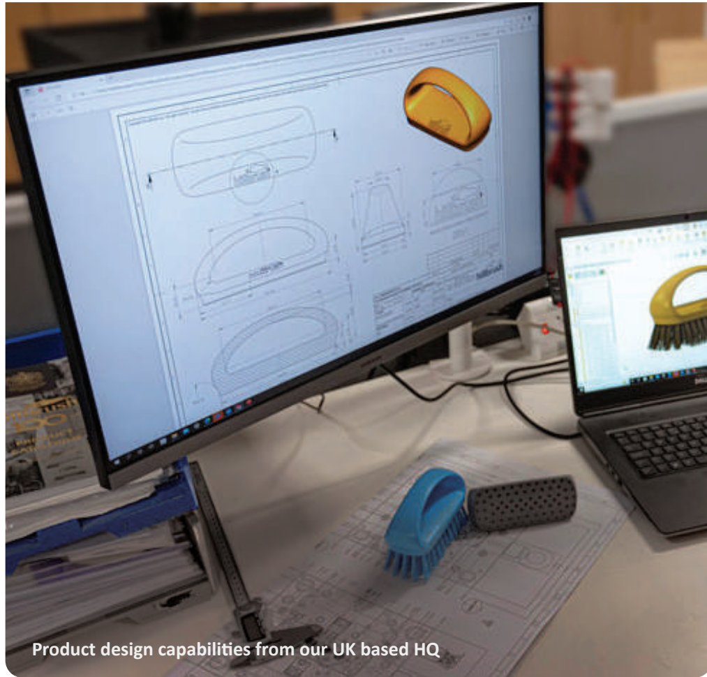
Product design capabilities from our UK based HQ