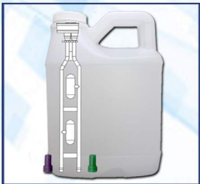
The metering tips are allocated inside each plastic bottle, at the base of the suction cannulas, instead of being inserted into the suction tubes of the dosing dispenser

It prevents unwanted manipulations on the dosing system and undesirable accidents changing the canisters. It guarantees a precise dosage each time, making maintenance of the dispenser practically unnecessary, as there will be new metering tips inside each canister. It also reduces the initial investment needed, by acquiring only one dispenser for every cleaning chemical products available on this range.