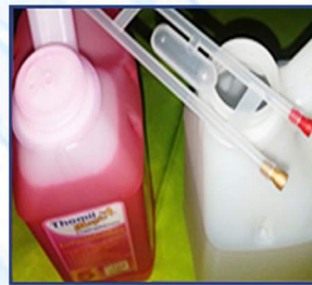
The auto-suction reservoir deposit avoids mixing chemicals in the dilution process.