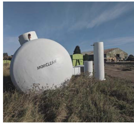
OXFORDSHIRE WASH BAY 10