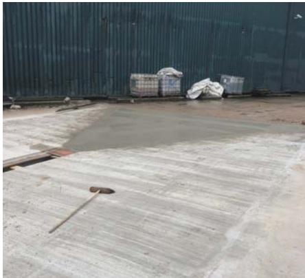
NANTWICH WASH BAY 29