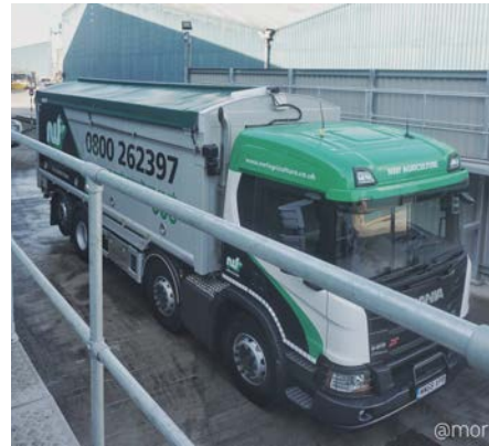
CHESHIRE WASH BAY 38