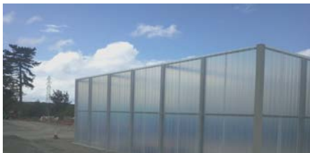
WREXHAM WASH BAY 55