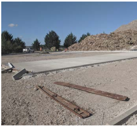
BUCKS RE- CYCLING BAY 03