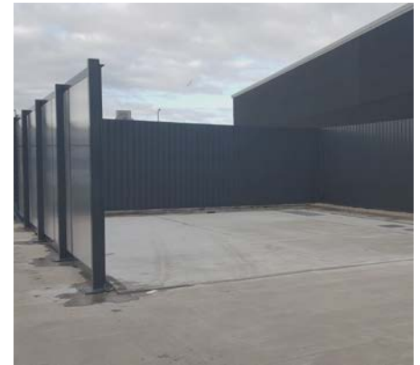
NEWCASTLE WASH BAY 46