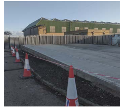
NOTTINGHAM WASH BAY 18