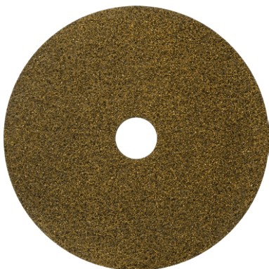
BLACK ROCK YELLOW Initial Polishing Pad