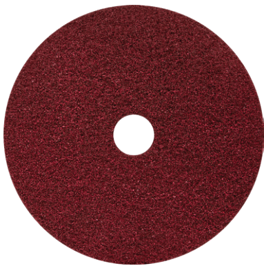
BLACK ROCK RED Heavy-Duty Cleaning Pad

The Black Rock Cleaning and Polishing System restores, cleans, and polishes concrete, natural stone, and a wide variety of other floor types. Through a range of abrasive levels, this four-pad system allows for a customizable floor care process based on the starting condition of the floor and the desired gloss level. Through our Integrated Matrix Technology™, microscopic abrasive particles embedded in the base web deliver mechanical cleaning action without the need for harmful chemical agents, achieving a clean, high gloss floor.