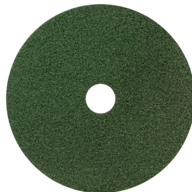
BLACK ROCK GREEN Polishing and Daily Maintenance Pad