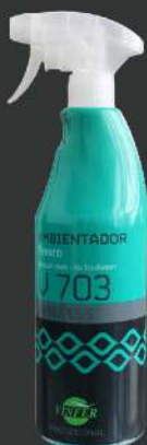
V703 FRESH AIR FRESHENER