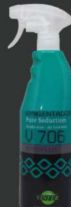
V706 PURE SEDUCTION AIR FRESHENER