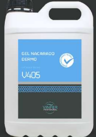
V405 DERMO PEARLY HAND GEL

Hand and body gels. It allows for frequent use without cracking or drying the skin. Its special formula with softening agents, surfactants and betaines do away with the dirt and at the same time preventing skin damage. During its use generates a consistent and creamy foam. Having the suitable viscosity so as to be correctly used in dispensers.