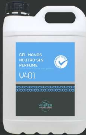
V401 UNSCENTED HAND GEL