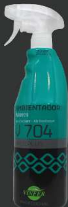
V704 AZORES AIR FRESHENER