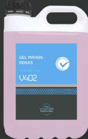
V402 ROSAS HAND GEL