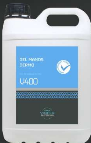
V400 DERMO HAND GEL

Gel dispenser with automatic sensor. Suitable for dosing both hydroalcoholic gel as well as hand gel.