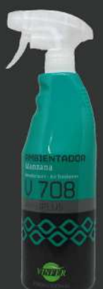
V708 APPLE AIR FRESHENER