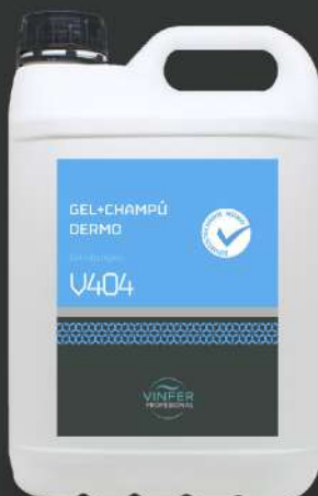
V404 DERMO GEL+SHAMPOO

Hand and body gels. It allows for frequent use without cracking or drying the skin. Its special formula with softening agents, surfactants and betaines do away with the dirt and at the same time preventing skin damage. During its use generates a consistent and creamy foam. Having the suitable viscosity so as to be correctly used in dispensers.