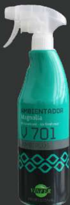
V701 MAGNOLIA AIR FRESHENER