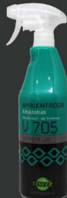
V705 AMAZONAS AIR FRESHENER