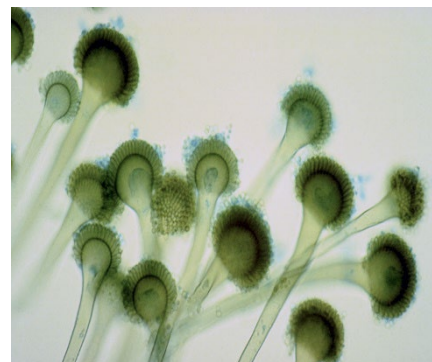
Common indoor spore-forming mold, Aspergillus .