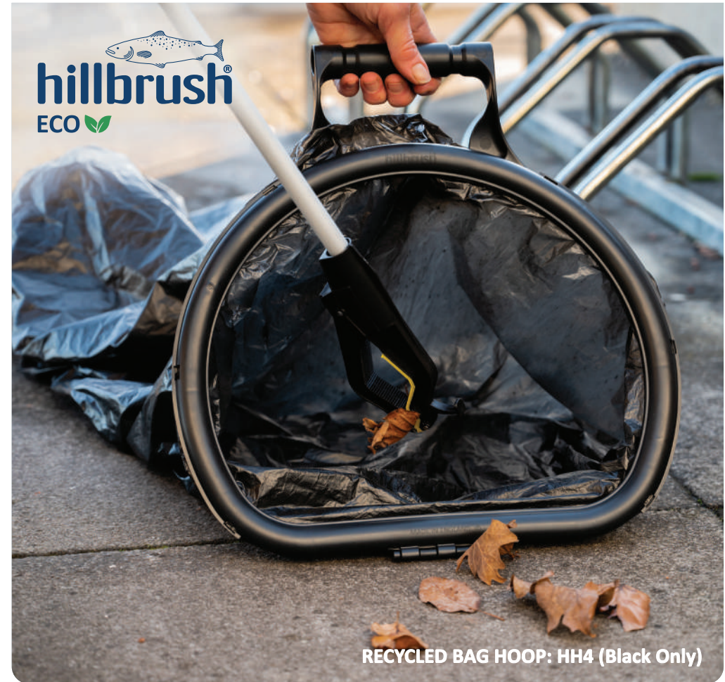
RECYCLED BAG HOOP: HH4 (Black Only)