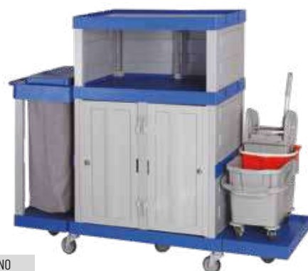
ART NO HLM 500 STE25D

3 x strong shelves with 90kg loading capacity, 100mm wheels with double bearing, 120L poly bag with zip, 2 doors, 25L Ergo Double Bucket Trolley with downpress wringer, ergonomic push handle with groove.