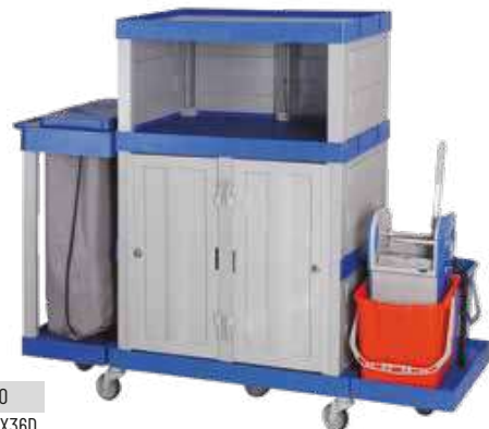
ART NO HLM 500 EX36D

3 X Strong Shelves With 90kg Loading capacity, 100mm Wheels With Double bearing, 120l Poly Bag With Zip, 2 Doors, 2x25l Double Bucket Trolley with Down Press Wringer, ergonomic Push Handle With Groove.