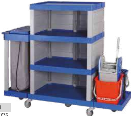
ART NO HLM 500 EX36

3 X Strong Shelves With 90kg Loading capacity, 100mm Wheels With Double bearing, 120l Poly Bag With Zip, 2x25l Double Bucket Trolley With down Press Wringer, Ergonomic Push handle With Groove.