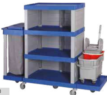
ART NO HLM 500 STE25

3 X Strong Shelves With 90kg Loading Capacity, 100mm Wheels With Double Bearing, 120l Poly Bag With Zip, 25l Ergo Double Bucket Trolley With Downpress Wringer, Ergonomic Push handle With Groove.