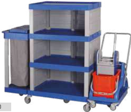
ART NO HLM 500 SCP

3 X Strong Shelves With 90kg Loading Capacity, 100mm Wheels With Double Bearing, 120l Poly Bag With Zip, Complete 2x25l moveable Double Bucket Trolley With Downpress Wringer, Ergonomic Push Handle With Groove.