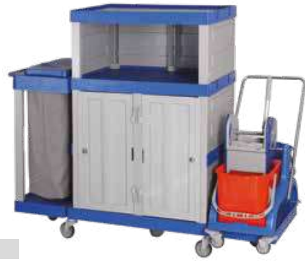
ART NO HLM 500 SCPD

3 X Strong Shelves With 90kg Loading Capacity, 100mm Wheels With Double Bearing, 120l Poly Bag With Zip, 2 Doors, complete 2x25l Moveable Double Bucket Trolley With Downpress Wringer, Ergonomic Push handle With Groove.