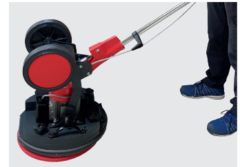
Turn the handle completely upside down to get maximum weight on the ground