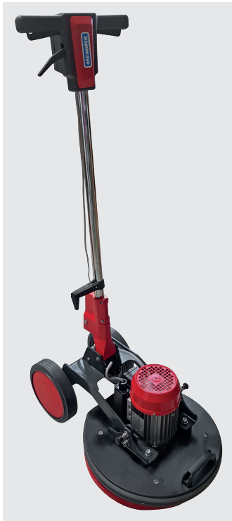
E44 Excenter Scope of delivery

Our patented handle adjustment as well as the large transport wheels for easy transportation are great advantages. Also useful are the two detents (750.586 kit detent pins) on the body that allow you to either lift the wheels off the ground to leave no running marks or turn the handle completely upside down to get maximum weight on the ground. By adding additional weights in pieces, you can perfectly adapt the machine weight to your application. Simply set up the brush head of the E44 Excenter and you can easily change the pads or store the machine.