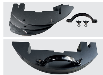
Weights easily adaptable (special accessories)