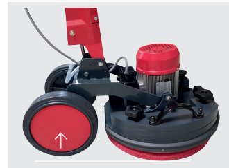
lift the wheels off the ground to leave no running marks