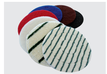
Large selection of pads