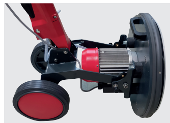
Brush head set up for optimal storage