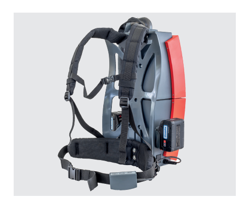
Ergonomic back frame