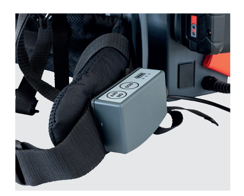
Control unit on the carrying strap