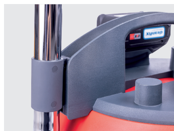
Holder for the suction tube