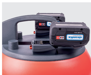
Easy mounting/dismounting of the batteries