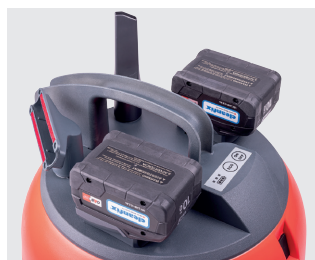
Batteries, operating buttons and standard accessories