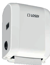
REF: CP-0525-B WHITE Finish