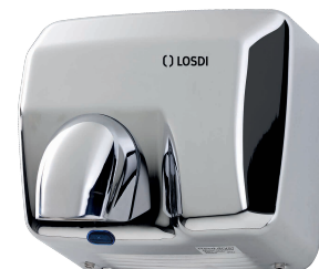
REF: CS-500-I/X BRIGHT STEEL Finish