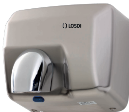
REF: CS-500-S/X SATIN STEEL Finish