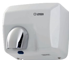
REF: CS-500-X WHITE LACQUERED METAL Finish