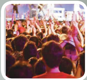
Sports stadiums and concert arenas