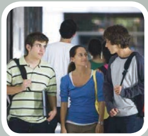
Schools and colleges