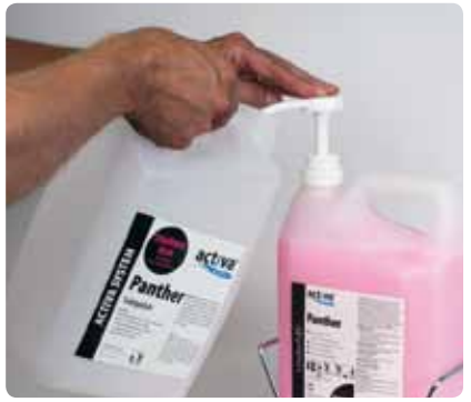
Mix the cleaning chemicals with water (to get ready-to-use chemicals) in the can and place it on the cleaning trolley.