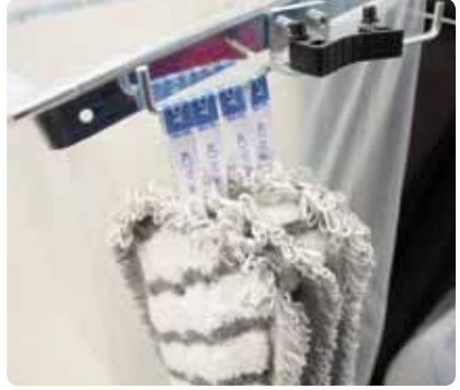
Equip the cleaning trolley with the amount of mops you will use during the cleaning (use dry mops, not prepared with water or chemicals).