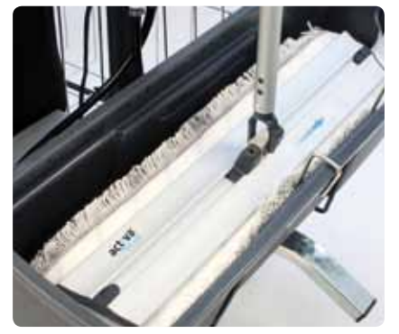
...and pick up a new, clean mop.