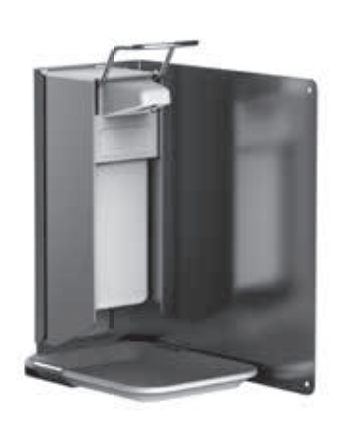
MOMHOSE AND MOOSA