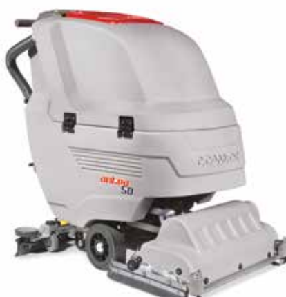
Antea 50 BTS