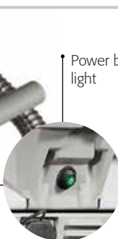
Power button light