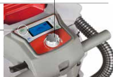
Control panel of traction versions