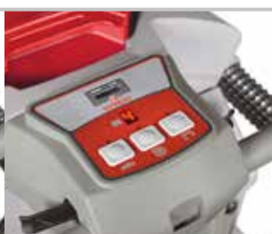
Control panel of B version