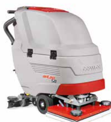
Antea 50 BTO Orbital