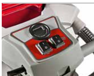
Control panel of E version