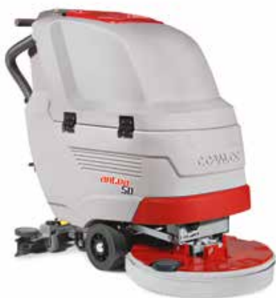
Antea 50 E/B/BT