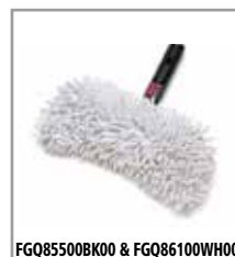
FGQ85500BK00 & FGQ86100WH00