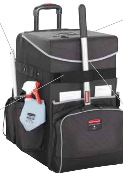
1902465 Quick Cart – Large

Durable lid conceals supplies and features hardware for adding a lock to prevent unauthorised access to cart and its contents.