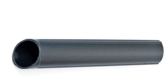
Extra-long day tool