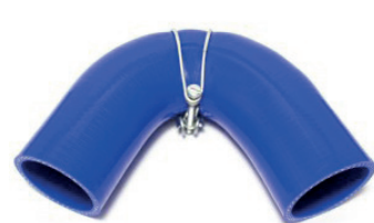
135 degree Goose neck