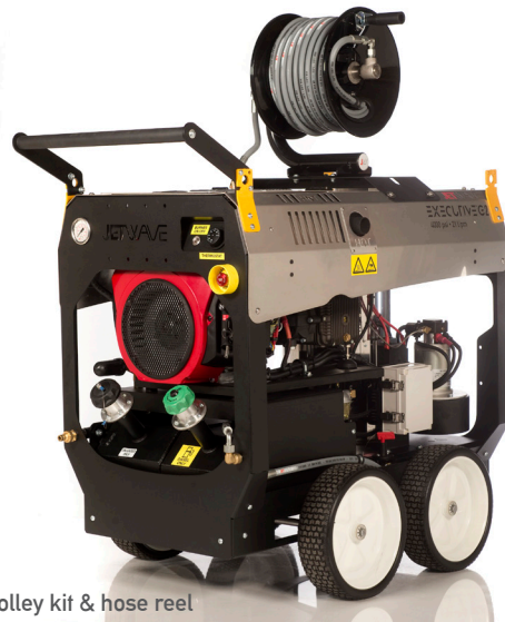
Shown with optional trolley kit & hose reel

The Jetwave® Executive™ G2 heavy duty professional hot water v-twin petrol powered by HONDA™ pressure washer revolutionary in its design and innovation. Australian engineered and assembled using only the best quality Italian and global components; it offers world first compact multi configurable modular design & cover protection to maximise safety, functionality and efficiency.