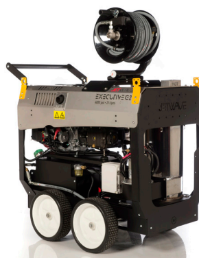
Shown with optional trolley kit & hose reel

Protection - Designed for durability and a long life.