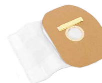
Microfibre vacuum bags