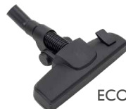
ECO floor tool