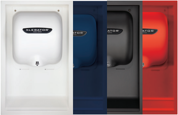
(Dryer Sold Separately)

2 Special paint colors include white, raven black, red baron and graphite. Custom paint colors are also available and require a minimum order of 5 or more. Call Excel Dryer for custom paint color options and pricing.