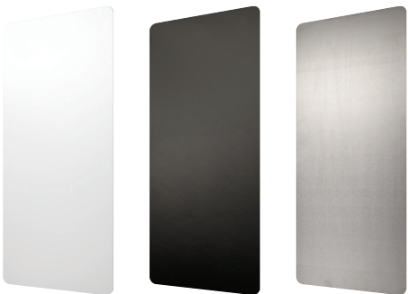
89W 89B 89S

Designed to fit securely below your Excel Hand Dryers, protecting your walls from water droplets that can be blown off wet hands by the powerful air stream. Microban technology inhibits the growth of bacteria and is built into the Wall Guard so it will not wash or wear away, lasting the lifetime of the product. Ideal for high-traffic restrooms, Wall Guards are hygienic and easy-to-clean.