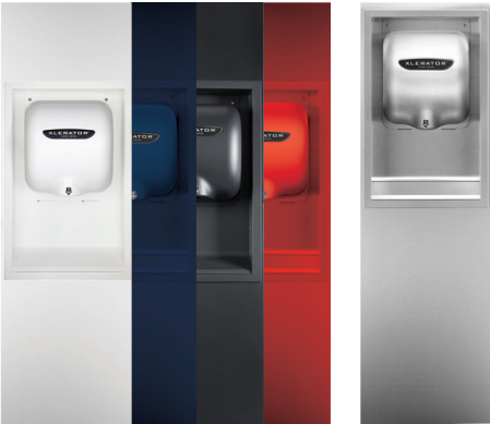
(Dryer Sold Separately)

3 Sold as set: 1 box containing 2 wall guards