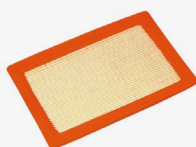
417428 HEPA outlet air filter