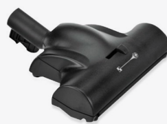
431651 Turbo nozzle for carpets, moquette and floors