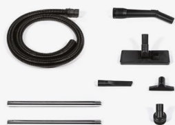
217223 KIT Basic Ø 32 mm CA15 Basic 109911