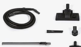
226312 KIT Extra HE Ø 32 mm CA15 Extra 109912 CA15 Silenzio 109913