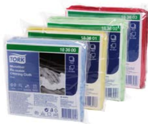
Tork Microfiber Cleaning Cloth