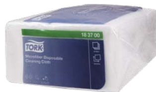
Tork Microfiber Disposable Cleaning Cloth