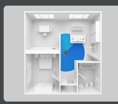
Automatic mapping, virtual walls and laser navigation (LiDAR).